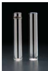
250µL Glass Flat Bottom Inserts