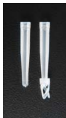
100µL Polypropylene Inserts

Inserts are available preassembled with a polymer bottom spring. The polymer spring acts as a shock absorber that protects against breakage if the needle bottoms out. The conical design permits complete sample removal.